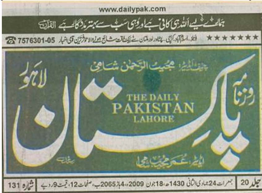
The Daily Pakistan Lahore June 18, 2009 and Daily Jinnah Lahore June 18, 2009

پاکستان میں زچہ و بچہ کی شرح اموات بہت زیادہ ہے، نیملہ ملک ہر 20 منٹ بعد ایک خاتون بچہ کی پیدائش کے دوران ہلاک ہو جاتی ہے، خصوصاً مل ہونا چاہئے حکومت اقوام متحدہ کی قرارداد تسلیم کر کے واضح پالیسی اپنانے کو شرح اموات میں کمی ہو سکتی ہے لاہور (پ ر) جمعی نائیک ایسوسی ایشن آف پاکستان میں پیدائش ماں اور بچہ کی اموات سمیت ہزاروں پاکستانی ڈاکٹریٹرز نے کہا ہے کہ اقوام متحدہ کے حوالے سے قرارداد پیش کی جائے گی۔ ایک بیان کے تحت انہوں نے حویہ کیا کہ اقوام متحدہ کی قراردادیں پیدائش کے وقت اموات کی شرح کو کم کرنے کے لیے اقوام متحدہ کی قراردادیں تسلیم کر کے واضح پالیسی اپنانے کو شرح اموات میں کمی ہو سکتی ہے۔ پاکستان میں ہر 20 منٹ بعد ایک خاتون بچہ کی پیدائش کے دوران ہلاک ہو جاتی ہے اس حوالے سے واضح پالیسی اپنانے سے اموات میں کمی ہو سکتی ہے۔